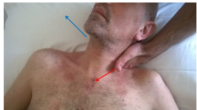
Figure 3 The left hand of the operator fixed the first rib at the level of the supraclavicular fossa of the trapezius muscle, while the other hand grabs the cervico-occipital junction, creating a passive tilt to the left side and a rotation to the right side; this movement needs to stretch the D1 costovertebral joint, limiting parasitic movements and avoiding the involvement of other joints.

Note: The red arrow indicates the direction of the thumb, to the coracoid insertion.