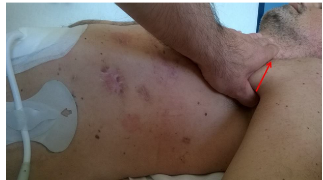
Figure 2 The thumb has to be put under the axilla, with cranial direction toward the coracoid insertion of the muscle, with the force vector being in the oblique axis; once identified the hypertonic area, under the pectoralis major, this position needs to be maintained until myofascial release occurs.

The next step included an HVLA to release the first left rib in an inspiratory attitude (elevation), with the patient being supine. The left hand of the operator fixed the first rib at the level of the supraclavicular fossa of the trapezius muscle, whereas the other hand grabs the cervico-occipital junction, creating a passive tilt to the left side and a rotation